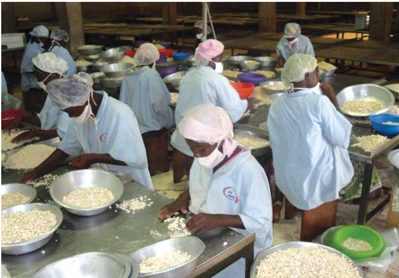
SALLE DE DEPELLICULAGE

Speaking about the nature of her work, she says she has a direct implication in her company’s activities. In other ways, just like the employees, she is at the office from eight in the morning and spends the whole day coordinating the different departments.